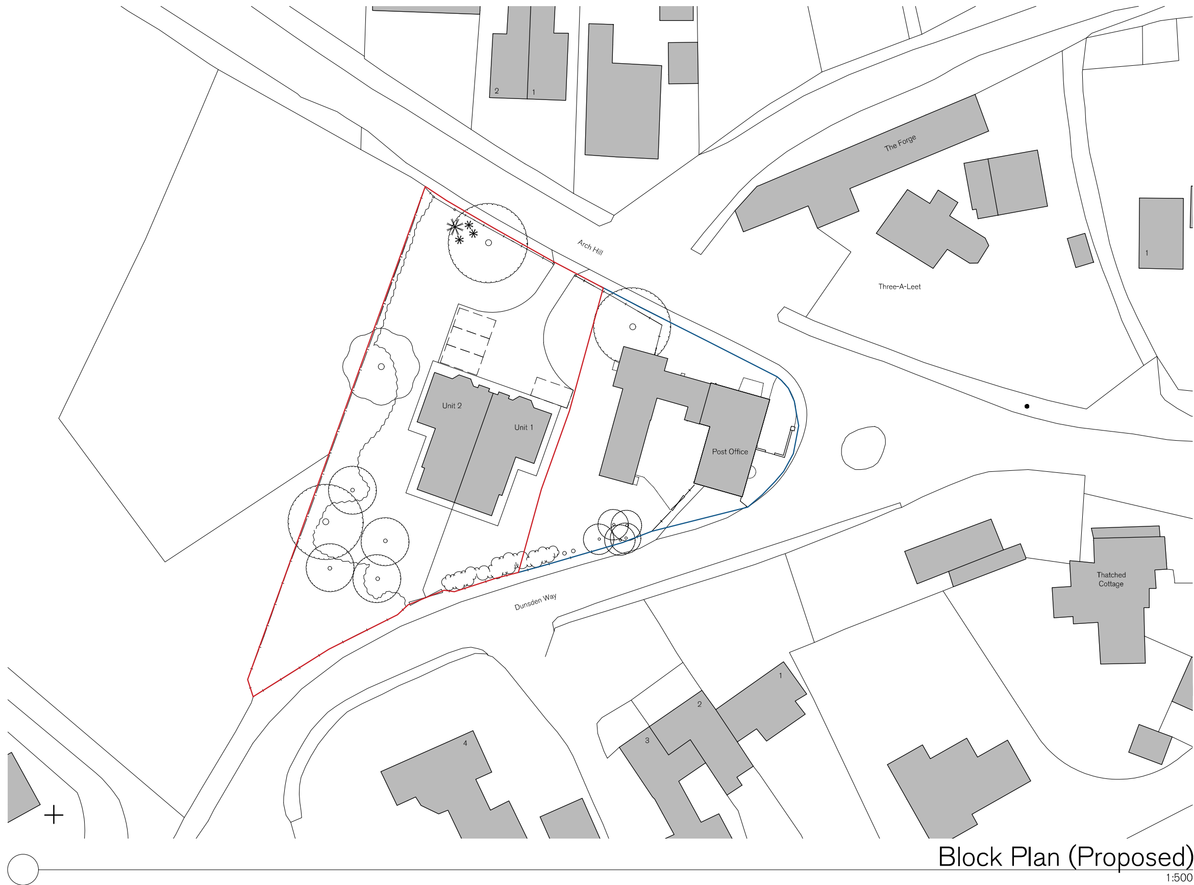
Block Plan (Proposed) 1:500